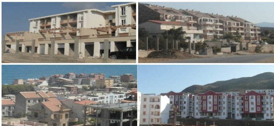
Figure 4. Views of the new, typically urban built landscape.

The images, taken by the author, explain the speed of urbanization along the Beni-Ksila coastal region. In a few years the rural landscape that characterized the region in the recent past is now on the way to becoming a typically urban landscape.