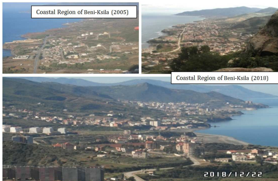
Figure 3. Rhythm of urbanization along the Beni-Ksila coastal region on the coast.

villages perched on the ridges overlooking the sea, is now on the way to becoming an urban landscape par excellence. The traditional village structure of yesteryear has given way to a typically urban structure, composed of small groups of new buildings typical of urban areas, along the coastal plain (See Figures 3 and 4). Many of the traditional Kabyle villages are abandoned by their populations who preferred to come and live on the plain. Villages that have been able to retain their populations have seen their former nuclei abandoned, their populations have preferred to build their new houses on the outskirts of the villages on large plots that are easily accessible.