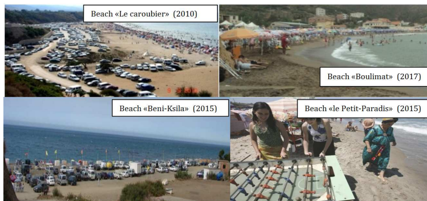
Figure 2. The flow of national holidaymakers on the beaches of the region (Source: Y. Icheboubene, 2017).

of Beni-Ksila, attracted 1.243 million holidaymakers (summer 2017), according to the Tizi-Ouzou wilaya tourism and handicrafts department, which provided the figure (see Figure 2). The cessation of emigration of local populations and the mass return of emigrant populations from the region, - it should be noted that the coastal region of Kabylia has already experienced an exodus to urban centres, particularly to Greater Algiers and France, which goes back a long way in history. An exodus that increased in the aftermath of the country's independence. And finally, the populations who are not native to the region and are attracted by the new situation to invest in it.